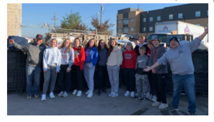
Unloading at the Open Door Mission

Kids after unloading was done—the two on the ends were a couple of workers there.